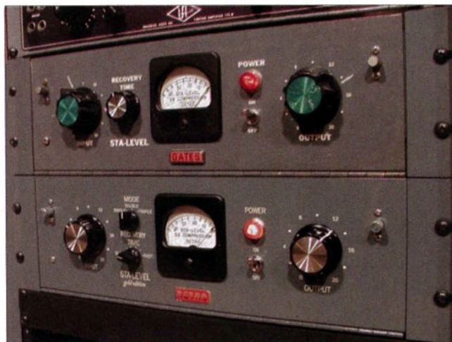
Top: The original Gates Sta-Level unit used on the Johnny Cash record. Bottom: The reissue Retro Sta-Level.

Mike Campbell, Benmont Tench and Howie Epstein brought such a great energy as Johnny's back-up band, playing a colorful selection of instruments including Dobros, harmoniums and, of course, Tom's signature Tele. I also brought my '61 Fender Esquire, as it was the classic guitar used on so many of the early Johnny Cash records. But for me, the star of the show was the Gates Sta-Level.